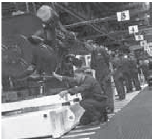
Fig. 5.3 Scientific and technical manpower: a rich ingredient of human capital

Empirical evidence to prove that increase in human capital causes economic growth is rather nebulous. This may be because of measurement problems. For example, education measured in terms of years of schooling, teacher-pupil ratio and enrolment rates may not reflect the quality of education; health services measured in monetary terms, life expectancy and mortality rates may not reflect the true health status of the people in a country. Using the indicators mentioned above, an analysis of improvement in education and health sectors and growth in real per capita income in both developing and developed countries shows that there is convergence in the measures of human capital but no sign of convergence of per capita real income. In other words, the human capital growth in developing countries has been faster but the growth of per capita real income has not been that fast. There are reasons to believe that the