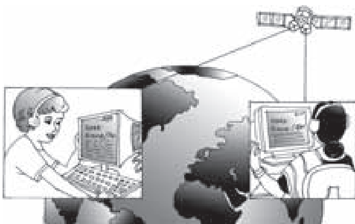
Fig. 3.1 Outsourcing: a new employment opportunity in big cities

global trade organisation to administer all multilateral trade agreements by providing equal opportunities to all countries in the international market for trading purposes. WTO is expected to establish a rule-based trading regime in which nations cannot place arbitrary restrictions on trade. In addition, its purpose is also to enlarge