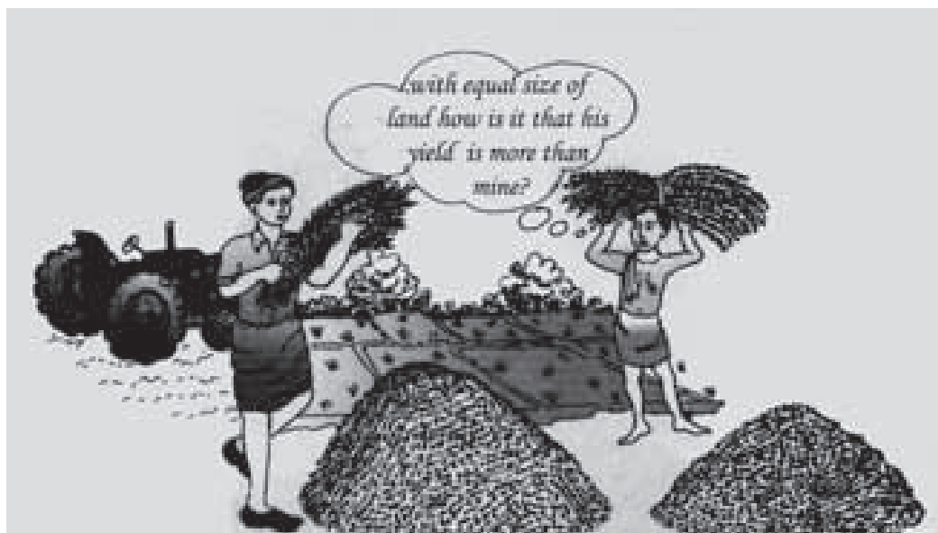
Fig. 5.1 Adequate education and training to farmers can raise productivity in farms

Education is sought not only as it confers higher earning capacity on people but also for its other highly valued benefits: it gives one a better social standing and pride; it enables one to make better choices in life; it provides knowledge to understand the changes taking place in society; it also stimulates innovations. Moreover, the availability of educated labour force facilitates adaptation of new