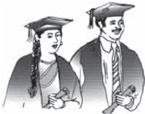
Fig. 5.7 Higher Education: few takers

The differences in literacy rates between males and females are narrowing signifying a positive development in gender equity; still the need to promote education for women in India is imminent for various reasons such as improving economic independence and social status of women and also because women education makes a favourable impact on fertility rate and health care of women and children. Therefore, we cannot be complacent about the upward movement in the literacy rates and we have miles to go in achieving cent per cent adult literacy.