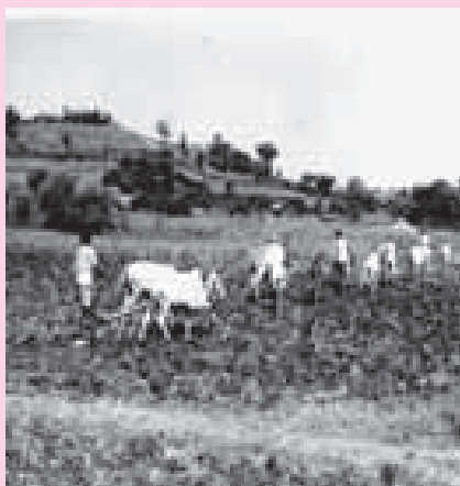
Fig. 1.1 India's agricultural stagnation under the British colonial rule

The French traveller, Bernier, described seventeenth century Bengal in the following way: "The knowledge I have acquired of Bengal in two visits inclines me to believe that it is richer than Egypt. It exports, in abundance, cottons and silks, rice, sugar and butter. It produces amply — for its own consumption — wheat, vegetables, grains, fowls, ducks and geese. It has immense herds of pigs and flocks of sheep and goats. Fish of every kind it has in profusion. From rajmahal to the sea is an endless number of canals, cut in bygone ages from the Ganges by immense labour for navigation and irrigation."