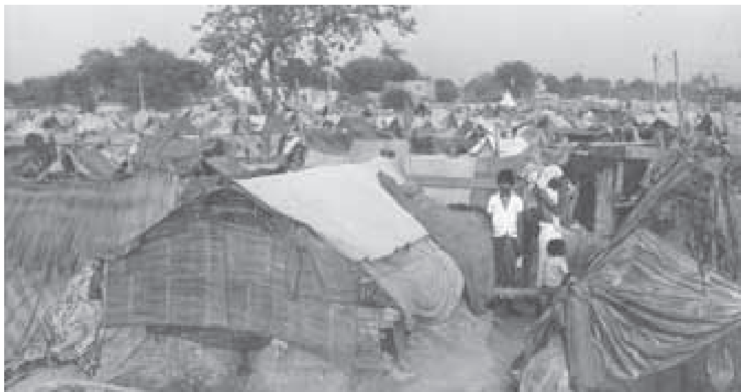
Fig. 1.3 A large section of India's population did not have basic needs such as housing

During the colonial period, the occupational structure of India, i.e., distribution of working persons across different industries and sectors, showed little sign of change. The agricultural sector accounted for