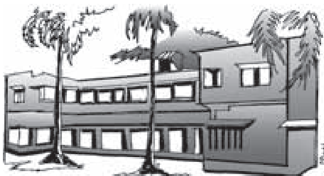
Fig. 5.5 Investment in educational infrastructure is inevitable

Himachal Pradesh to as low as Rs 2200 in Punjab. This leads to differences in educational opportunities and attainments across states.