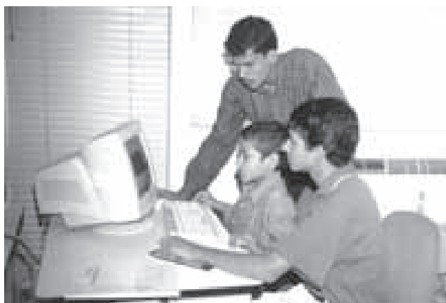
Fig. 5.4 Job on hand: transforming India into a knowledge economy

among four major growth centres in the world by the year 2020. It further states, "Our empirical investigation supports the view that human capital is the most important factor of production in today's economies. Increases in human capital are crucial to achieving increases in GDP." With reference to India it states, "Between 2005 and 2020 we expect a 40 per cent rise in the average years of education in India, to just above 7 years..."