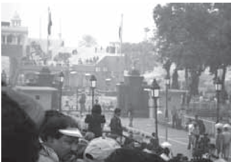
Fig. 10.1 Wagah Border is not only a tourist place but also used for trade between India and Pakistan

goods. At this stage, enterprises owned by government (known as State Owned Enterprises—SOEs), which we, in India, call public sector enterprises, were made to face competition. The reform process also involved dual pricing. This means fixing the prices in two ways; farmers and industrial units were required to buy and sell fixed quantities of inputs and outputs on the basis of prices fixed by the government and the rest were purchased and sold at market prices. Over the years, as production increased, the proportion of goods or inputs transacted in the market also increased. In order to attract foreign investors, special economic zones were set up.