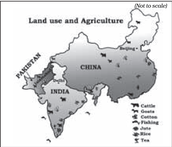
Fig. 10.2 Land use and agriculture in India, China and Pakistan

When many developed countries were finding it difficult to maintain a growth rate of even 5 per cent, China was able to maintain near double-digit growth for more than two decades as can be seen from Table 10.2. Also notice that in the 1980s Pakistan was ahead of India; China was having double-digit growth and India was at the bottom. In 2005-13, there is a marginal decline in India and