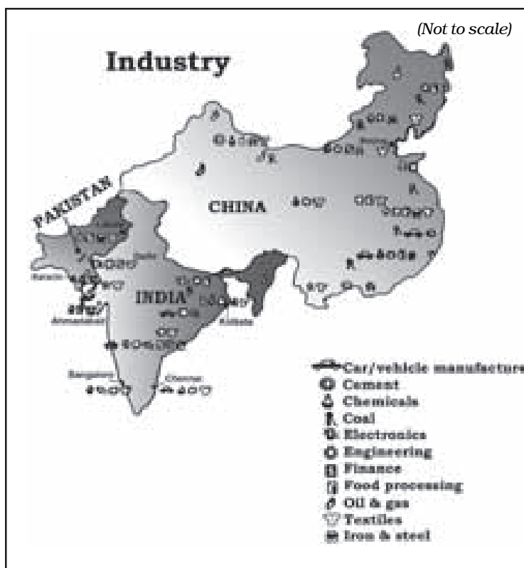
Fig. 10.3 Industry in India, China and Pakistan.

China's growth rates whereas Pakistan met with drastic decline at 4.4 per cent. Some scholars hold the reform processes introduced in 1988 in Pakistan and political instability as reasons behind this trend. We will study in a later section which sector contributed to this trend in these countries.