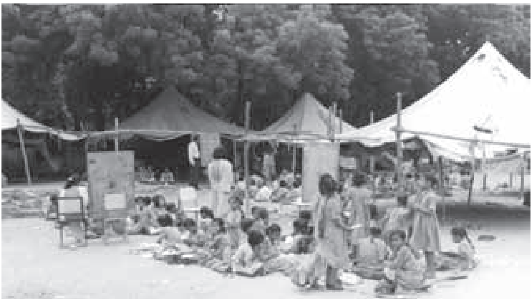
Fig. 5.2 Creating human capital: a school being run in make shift premises in Delhi

uninterrupted labour supply for a longer period of time, then health is also an important factor for economic growth. Thus, both education and health, along with many other factors like on-the-job training, job market information and migration, increase an