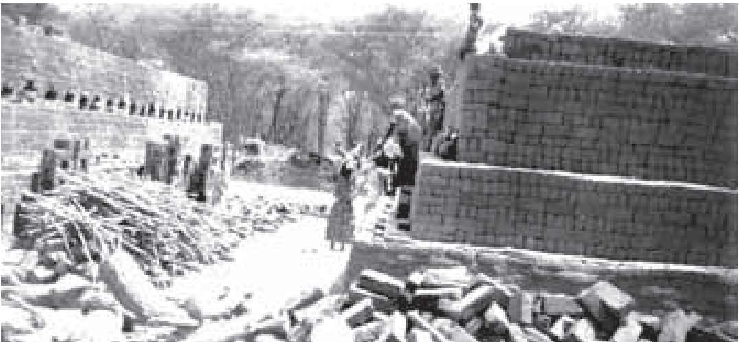
Fig. 5.6 School dropouts give way to child labour: a loss to human capital

Dream: Though literacy rates for both — adults as well as youth — have increased, still the absolute number of illiterates in India is as much as India's population was at the time of independence. In 1950, when the Constitution of India was passed by the Constituent Assembly, it was noted in