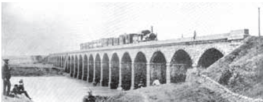
Fig. 1.4 First Railway Bridge linking Bombay with Thane, 1854

Indian people gained owing to the introduction of the railways, were thus outweighed by the country's huge economic loss.