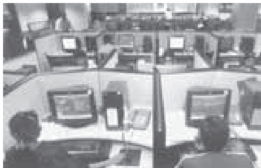
Fig. 3.2 IT Industry is seen as a major contributor to India's exports

Some scholars question the usefulness of India being a member of the WTO as a major volume of international trade occurs among the developed nations. They also say that while developed countries file complaints over agricultural subsidies given in their countries, developing countries feel cheated as they are forced to open up their markets for developed countries but are not allowed access to the markets of developed countries. What do you think?